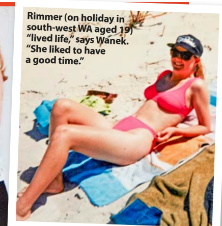
Rimmer (on holiday in south-west WA aged 19) "lived life," says Wanek. "She liked to have a good time."